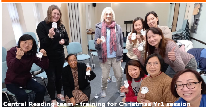
Central Reading team - training for Christmas Yr1 session