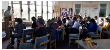
For our training, we thank you, Lord