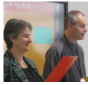
Difficult Questions Yr8