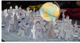
Yr6 Easter session