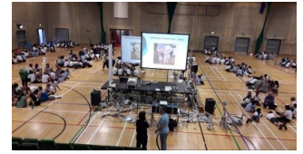
Transition Event Yr6