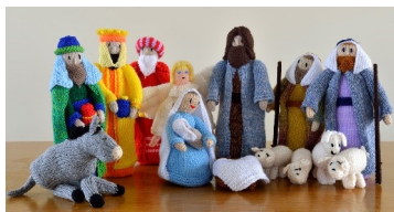
Nativity figures used in Christmas sessions