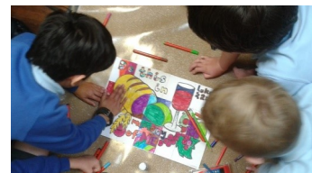
Making a collage of bread and wine