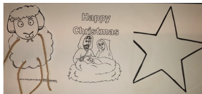
Christmas Yr1 activities